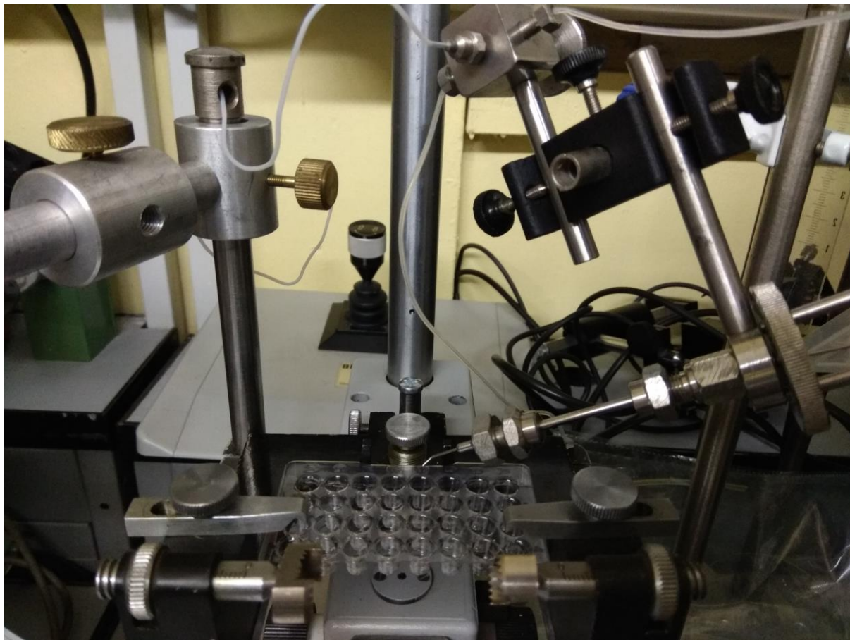
Fig. 3. The installation stand of the interference detection system for the microinjection circuit with a capillary chromatographic micro-column with parallel signal removal from the column.