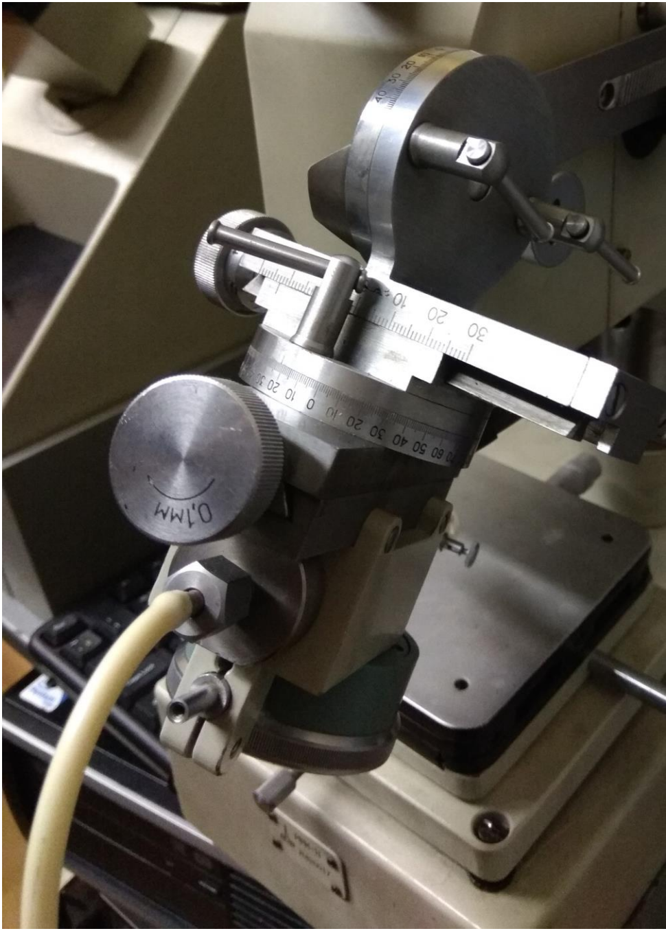
Fig. 2. Systems of angular positioning of the micromanipulator.